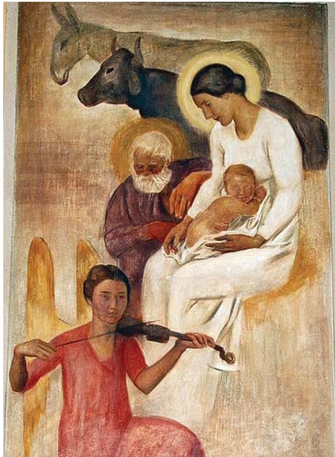
Fresco of the Holy Family