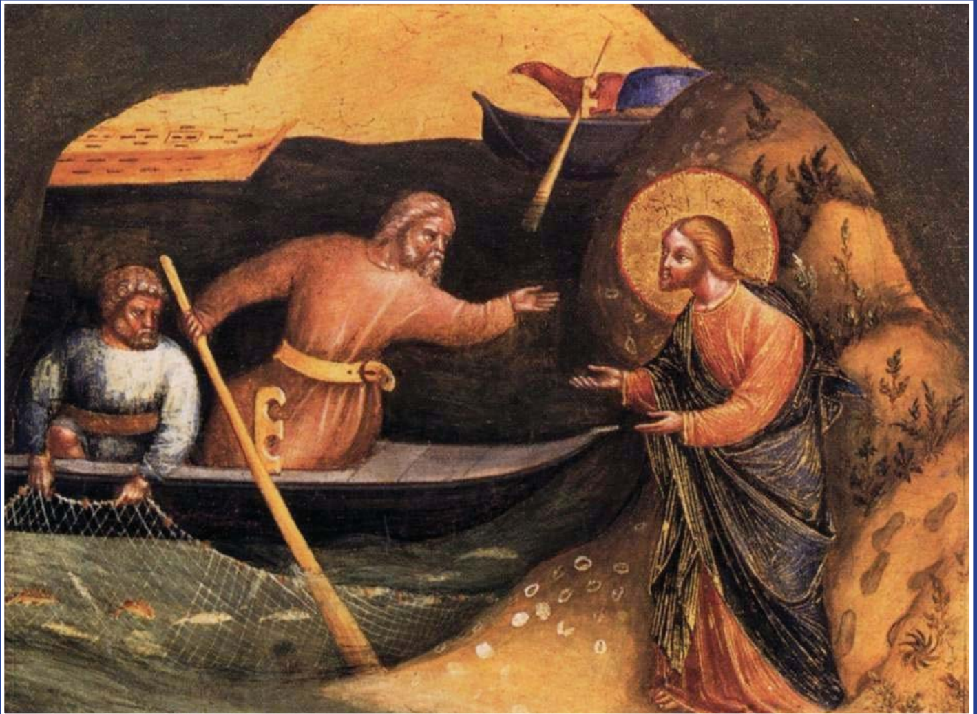
"Calling of the Apostles" by Lorenzo Veneziano

As he passed by the Sea of Galilee, he saw Simon and his brother Andrew casting their nets into the sea; they were fishermen.