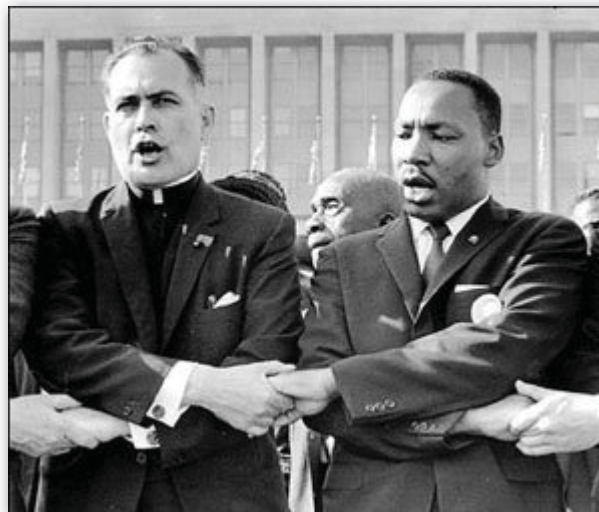
Question #s 100-102 of DOCAT , the Social Teaching of the Catholic Church for Youth. With thanks to the publisher of the English edition, Ignatius Press ( ignatius.com ), for permission to reprint.

the principle of subsidiarity still holds, from an ethical perspective we must learn to think globally. Many questions, such as epidemics or migration, can be dealt with only at the global level if we want to arrive at long-term solutions that are good for all the people on Planet Earth.